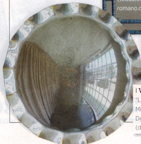
| Well-rounded "Laurel Convex Mirror" from Downtown, $5,300. (downtown20.net)