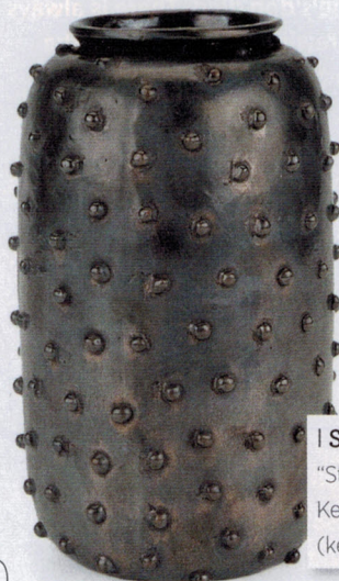
| Studly Vessel "Studded Vase" by Kelly Wearstler, $895. (kellywearstler.com)

At Traditional Home , we seem to have cornered the market on showhouses. We host a lot of them, and we always keep our eyes peeled for the clever tricks our seasoned decorators employ. To mask an awkward floor plan, give depth to a teensy-weensy space, or cover up bad bones, our talented designers keep their eyes ever trained on the latest and greatest trends.