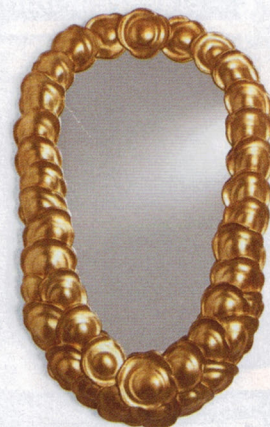
| Gold Rush "Fungi Mirror" in gold by Arteriors, $1,800. (bronsondesign.com)