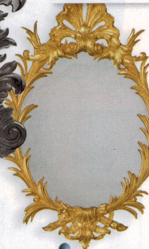
| Royal Reflection "English Oval George Mirror—Napoli" by De Gournay through Bespoke Global, $4,800. (bespokeglobal.com)