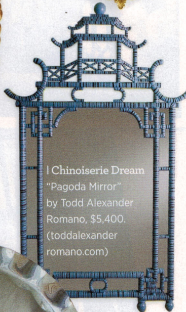
| Chinoiserie Dream "Pagoda Mirror" by Todd Alexander Romano, $5,400. (toddalexanderromano.com)